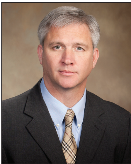
Transportation Commissioner Northern District (3)