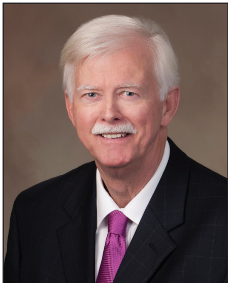
Transportation Commissioner Southern District (2)