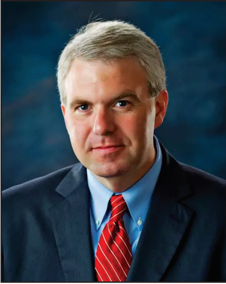
Public Service Commissioner Northern District (3)